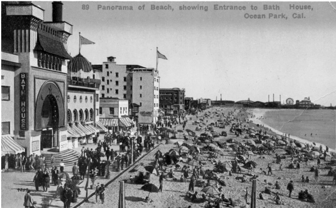
89 Panorama of Beach, showing Entrance to Bath House, Ocean Park, Cal.