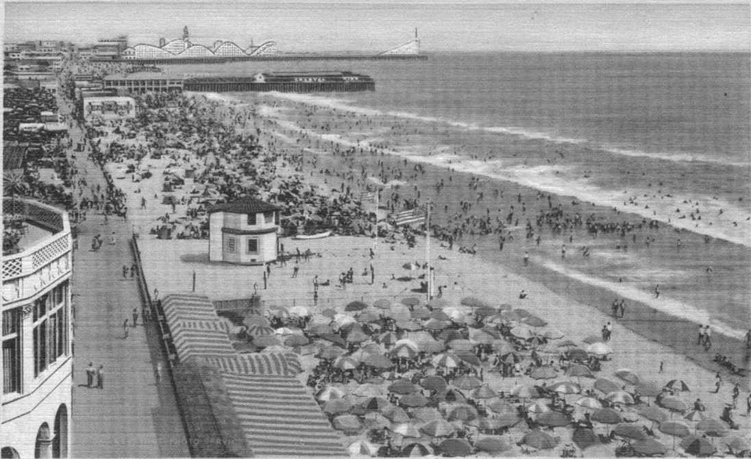
SM-32 LOOKING TOWARDS OCEAN PARK FROM BEACH CLUBS, SANTA MONICA, CALIFORNIA