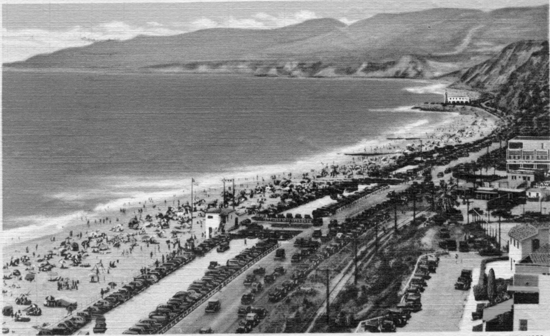
SM-33 LOS ANGELES COUNTY BEACH, SANTA MONICA, CALIFORNIA