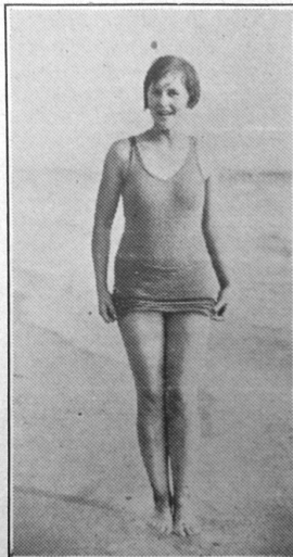
MISS IMOGENE INGALLS, Popular actress from San Fran- cisco, whose main recreation is periodic visits to the beach at Palisades Del Rey.