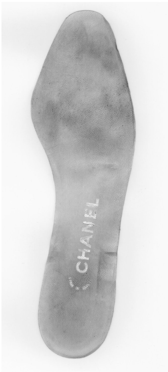
Inside of a shoe, 1996