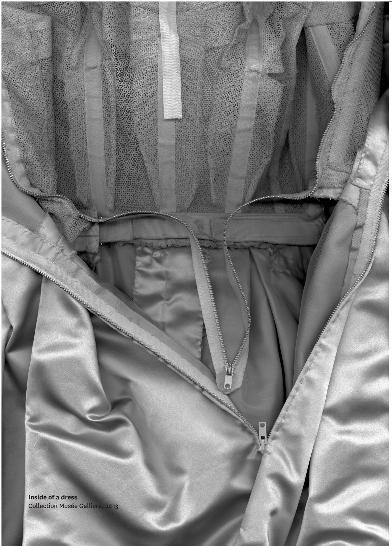
Inside of a dress Collection Musée Galliera, 2013