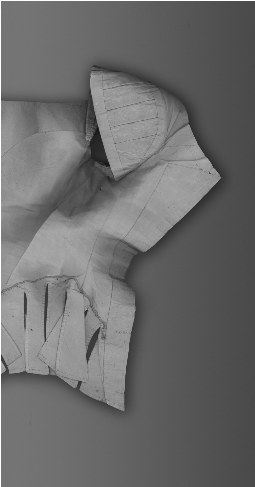
Corset of Marie-Antoinette Collection Musée Galliera, 2016