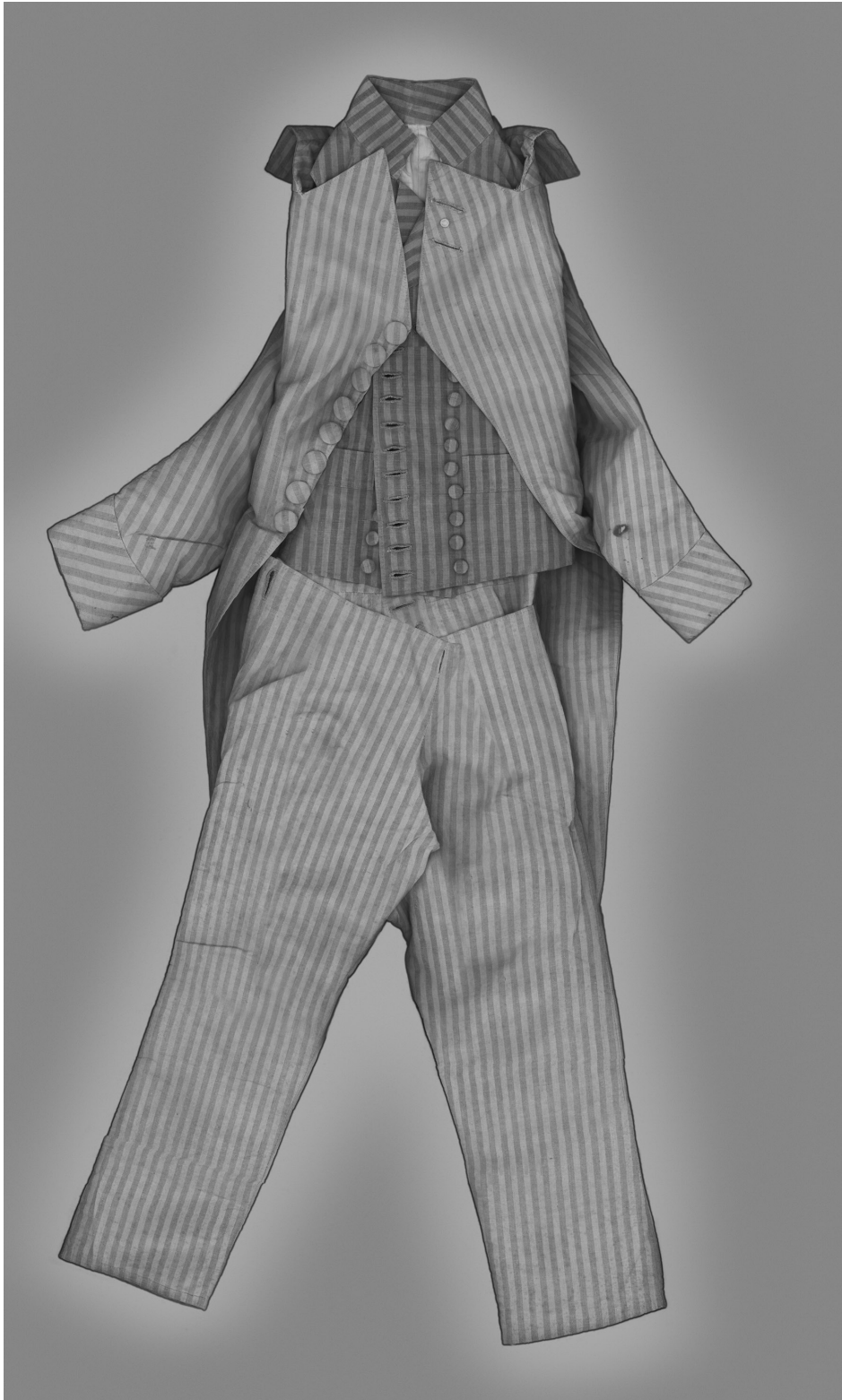
Clothing of le Dauphin, son of Marie-Antoinette Collection Musée Galliera, 2015