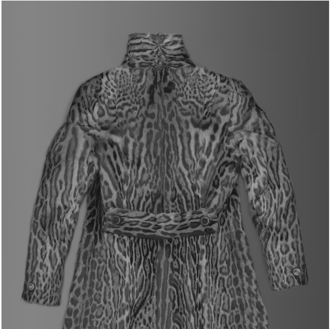
Dior leopard skin coat, Collection Musée Galliera, 2012