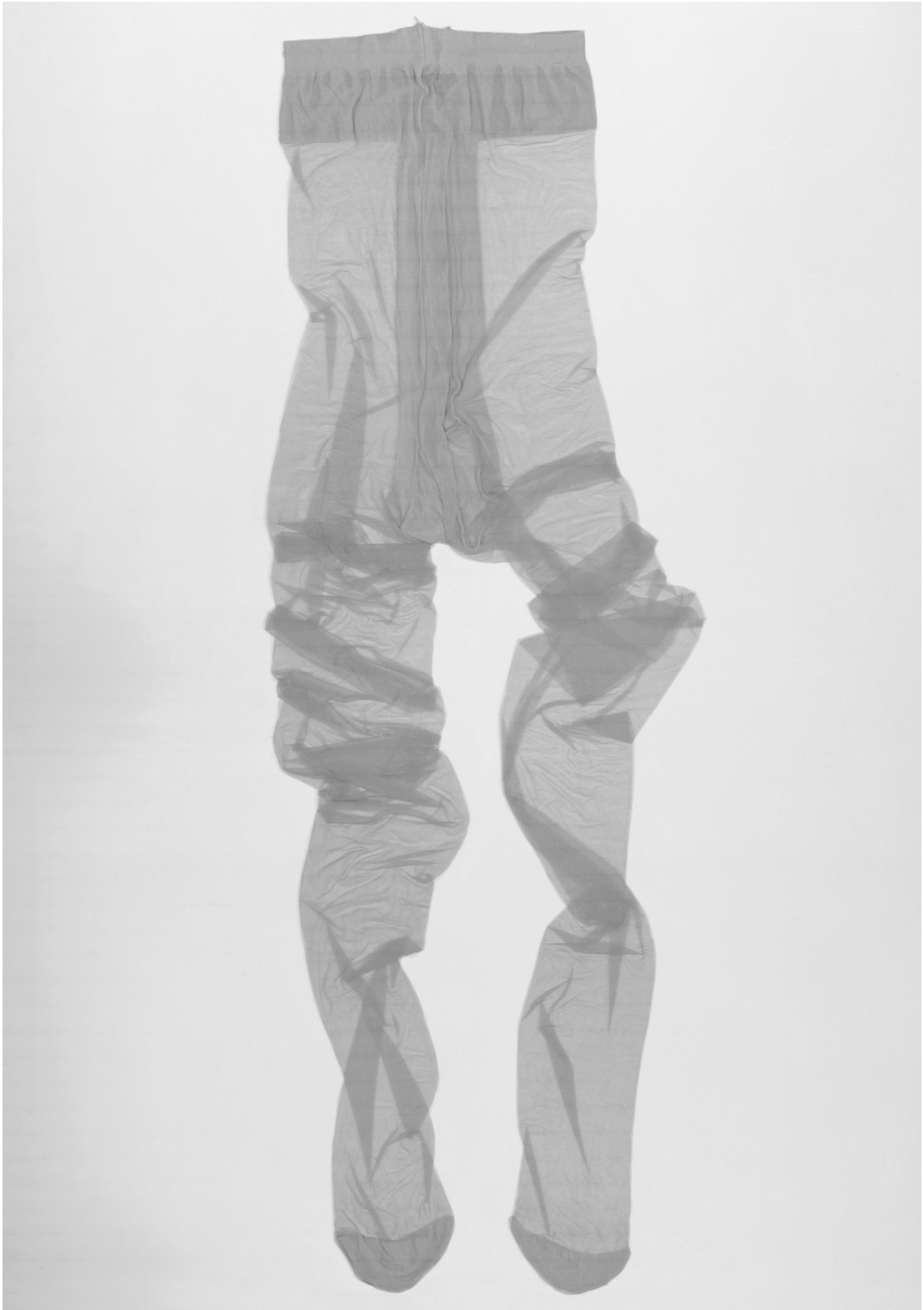
Ladies tights, 1996